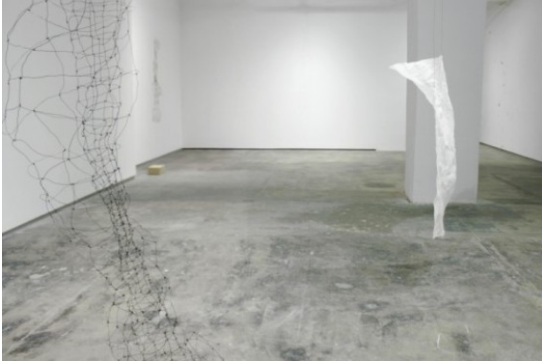
Installation shot of the exhibition under review, courtesy of Josée Bienvenu Gallery